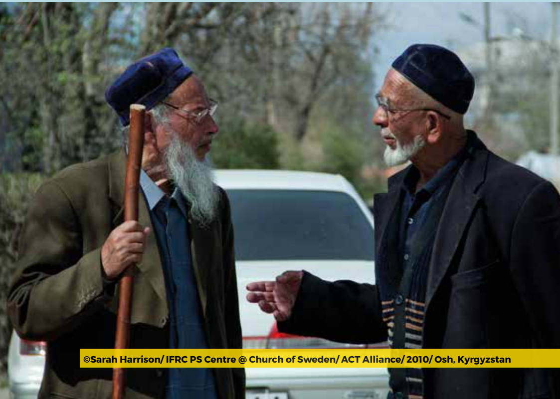
©Sarah Harrison/ IFRC PS Centre @ Church of Sweden/ ACT Alliance/ 2010/ Osh, Kyrgyzstan

During quarantine, where possible, safe communication channels should be provided to reduce loneliness and psychological isolation (e.g. WeChat).