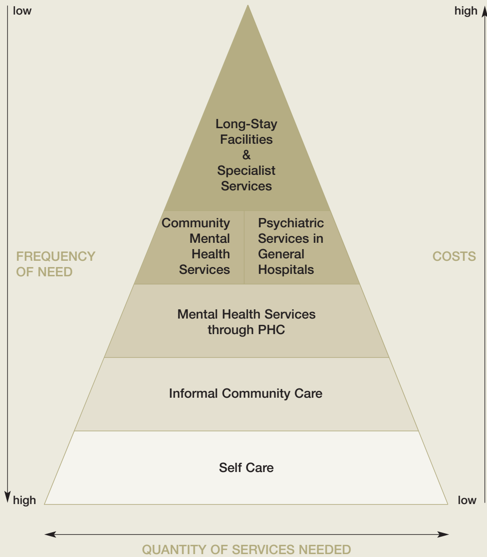
Figure 2: Optimal mix of different mental health services